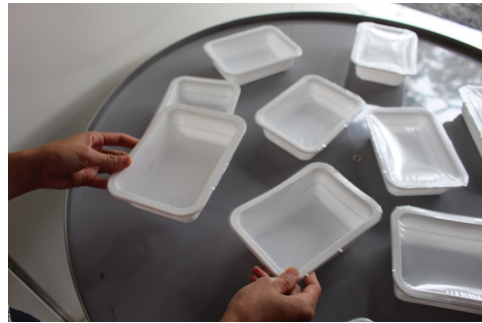
Accumulation Turntable allows you to have a buffer for your manual packing operations