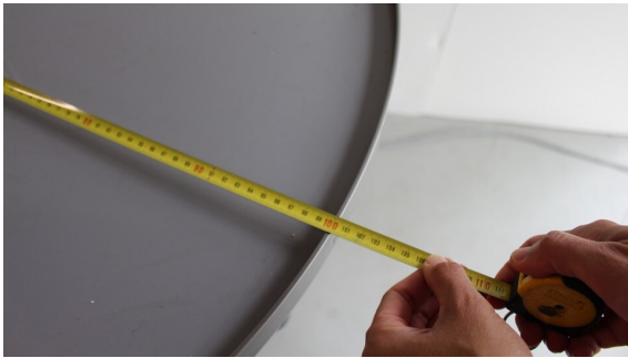
The rotary disk measures 1000 mm across. ( Option larger sizes available)