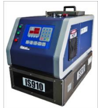
Hot melt system

This cartoner adopts intermittent design, PLC control, simple structure and easy maintenance. The cartoning system is equipped with a push-loading overload protection function to protect the blister and leaflet from being safely loaded into the carton. The machine is designed for low maintenance. If there is no product, no carton will be placed, and the alarm will sound.