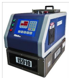
Hot melt system

This cartoner adopts intermittent design, PLC control, simple structure and easy maintenance. The cartoning system is equipped with a push-loading overload protection function to protect the blister and leaflet from being safely loaded into the carton. The machine is designed for low maintenance. If there is no product, no carton will be placed, and the alarm will sound.