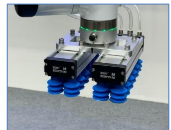
ABB Robot System