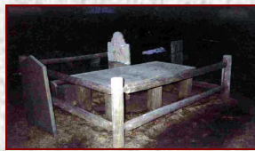
Above is the cenotaph of Adoniram Judson who died at sea enroute to America.

A memorial marker built in remembrance of a deceased person or group of people buried elsewhere; a structure built to honor the people who were killed in a war or lost at sea.