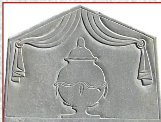
Photo was taken after cleaning and was illegible prior to