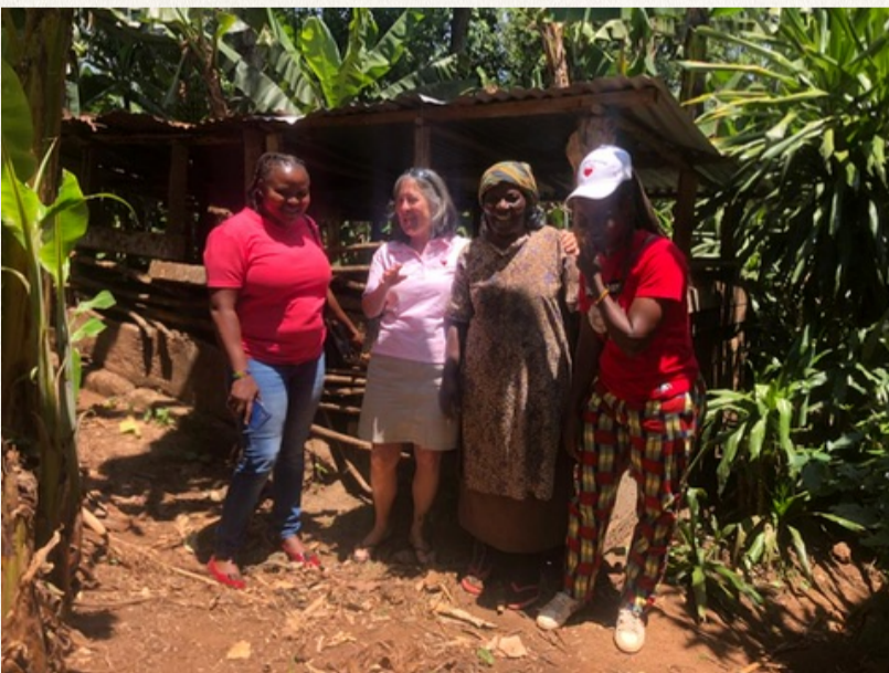
Visit to women business & SACCO's