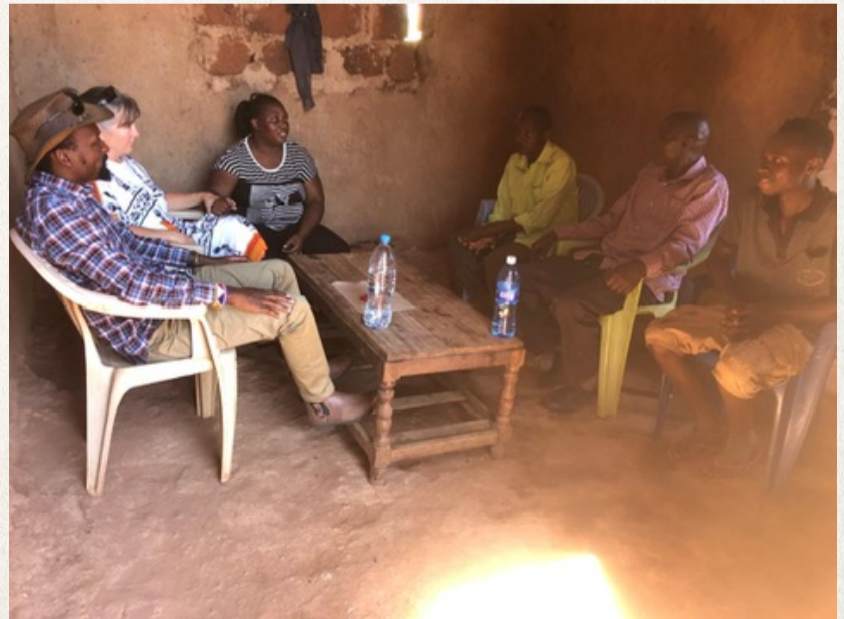
Meeting with government Mikameni village to discuss water supply project