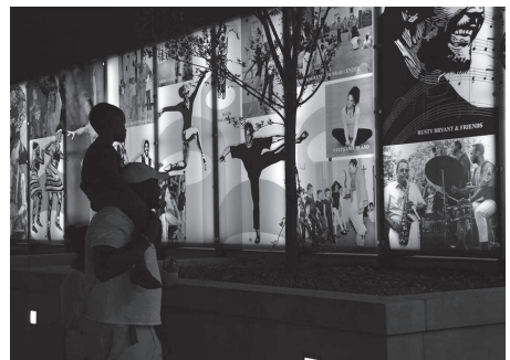
Bottom Left: 5th Annual MLK Jr. Birthday Breakfast; Bottom Middle: Memorial Day Parade on Mt. Vernon Avenue; Bottom Right: A Family Affair, Long Street Cultural Wall.