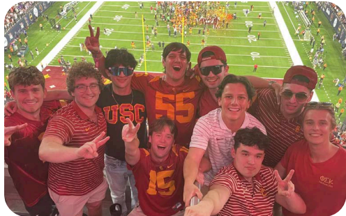
A group of brothers drove four hours to Las Vegas to witness USC play LSU in their opening game. The guys had a great time in the city and an even better time chirping LSU fans as the Trojans got the upset victory.

J oin us for our annual Alumni Dinner on November 15. You won't want to miss this year's event! Highlights will include the recognition of our very first Hall of Fame honoree, a barbecue dinner, and a few hours of fellowship with brothers from all eras. See page 1 for more details and how to register!