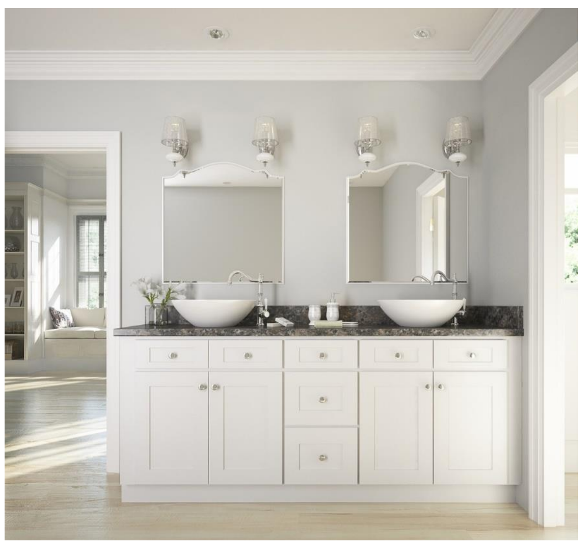
Brilliant White Shaker