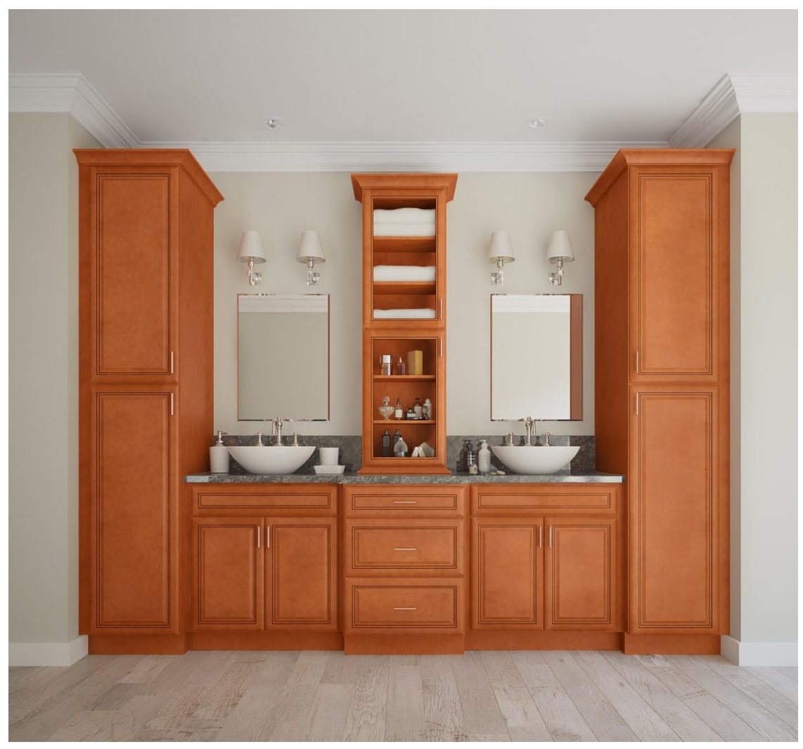
Regency Spiced Glaze