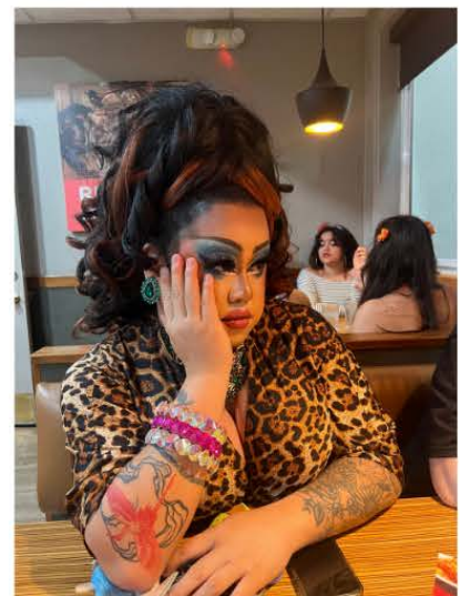
MGOA '25 was HUNGRY