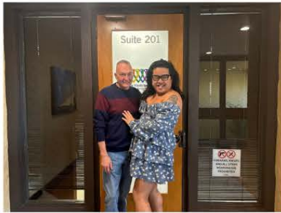
Visiting Rainbow Youth Project at their new Location