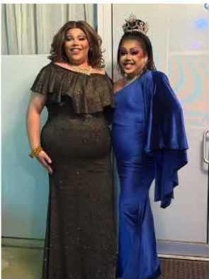
Me and my Daughter