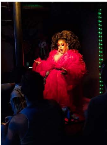
Trying to give that Texas Drag