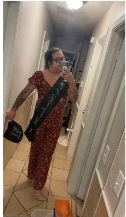
FINALLY GOT MY SASH