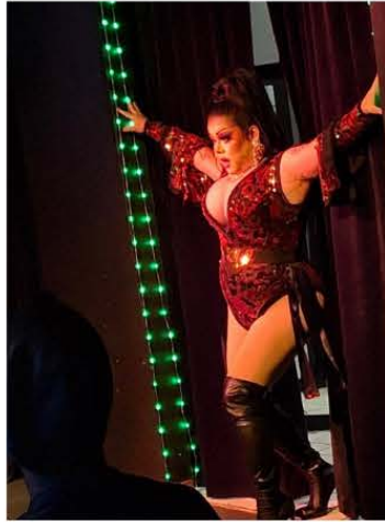
Oh Yall Wanted an Asian Host