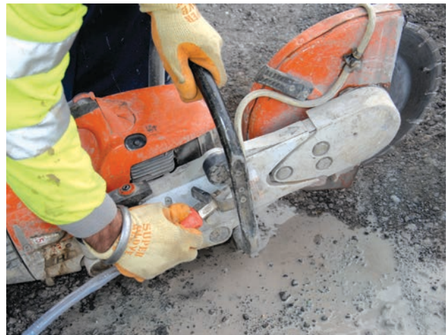
Figure 3 Water suppression on a cut-off saw