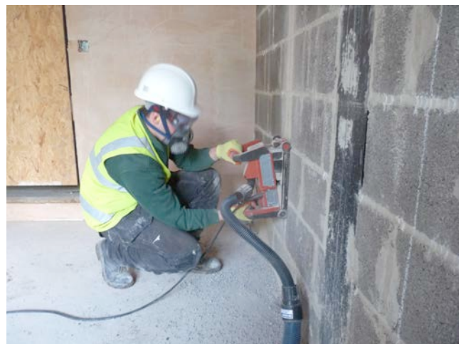
Figure 4 Wall chasing using on-tool extraction