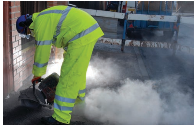
Figure 1 Common tasks like cutting can create very high dust levels

However, most of these diseases take a long time to develop. Dust can build up in the lungs and harm them gradually over time. The effects are often not immediately obvious. Unfortunately, by the time it is noticed the total damage done may already be serious and life changing. It may mean permanent disability and early death.