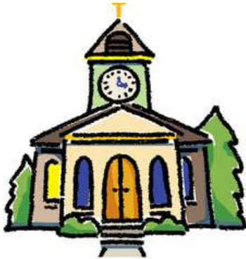
Interim Rector's Church Hours

Holy Eucharist: Sundays at 8:30, 11:00 and 5:00pm. and Wednesday Noon Eucharist