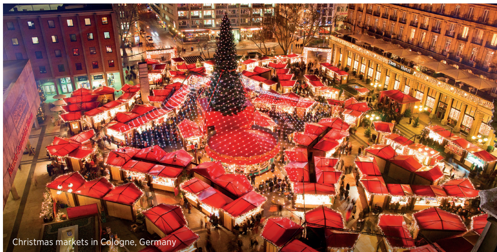
Christmas markets in Cologne, Germany