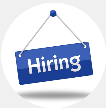
Interviewing Now! Event Coordinator