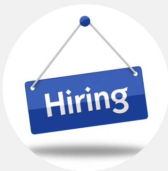
Interviewing Now! Public Relations