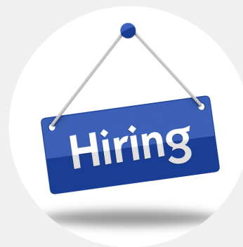
Interviewing Now! Sponsorship Director