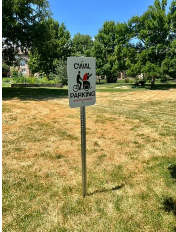
Parking Space at RiverPointe