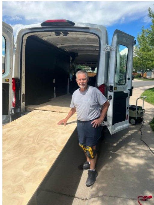
Dan Judish painted interior & ramp.