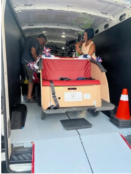
Second in position.