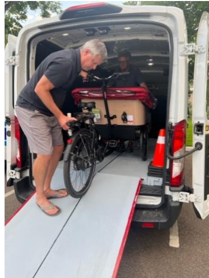
Loading the first Trishaw