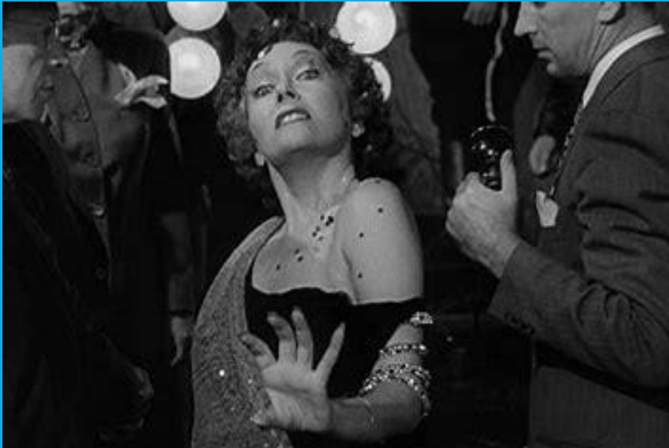
Gloria Swanson in “Sunset Blvd” (1950)

“To all you wonderful people out there in the dark,” and in the sunlight, who attended the 30 th Annual Music Box Steps Day and helped make it extra special!