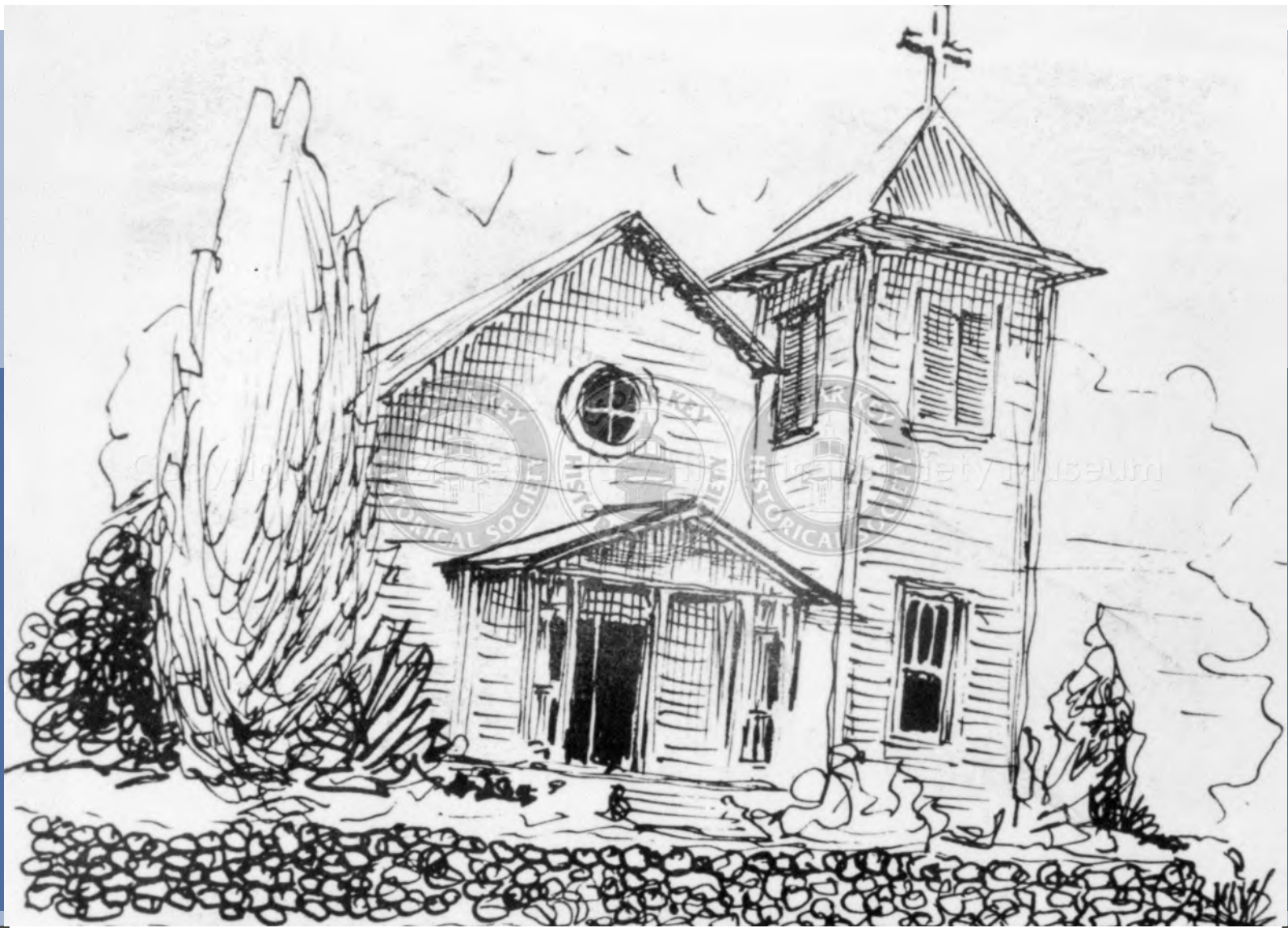
IMG06006 drawing of Christ Episcopal Church 1925-1950