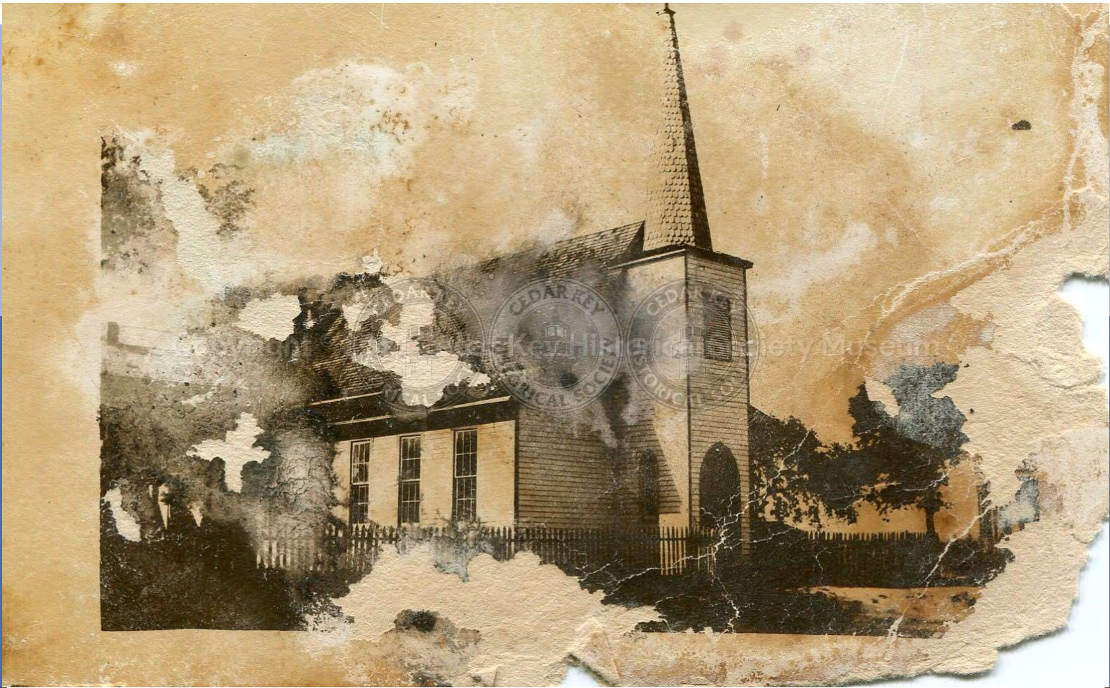
IMG06002 Episcopal Church pre-1925