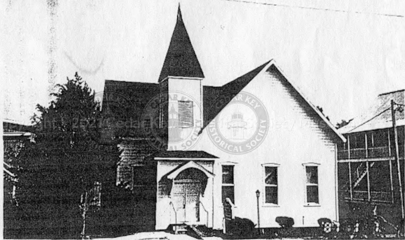
43 CEDAR KEY UNITED METHODIST CHURCH