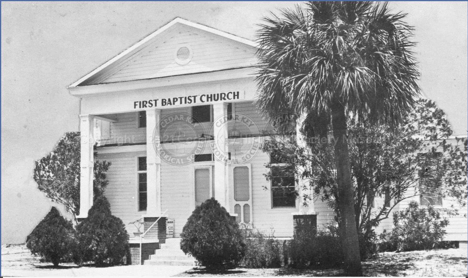
IMG06021 First Baptist Church