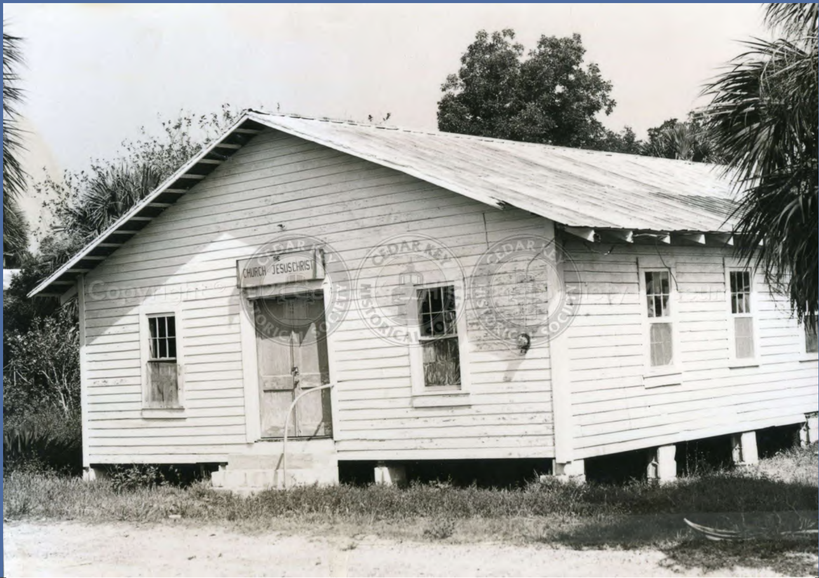
IMG06016 The Church of Jesus Christ