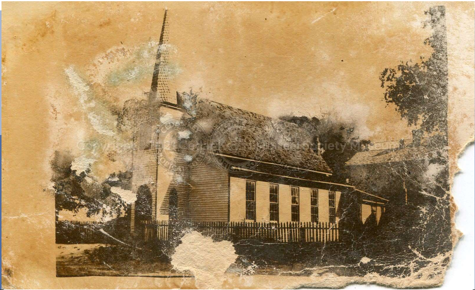
IMG06001 Episcopal Church pre-1925