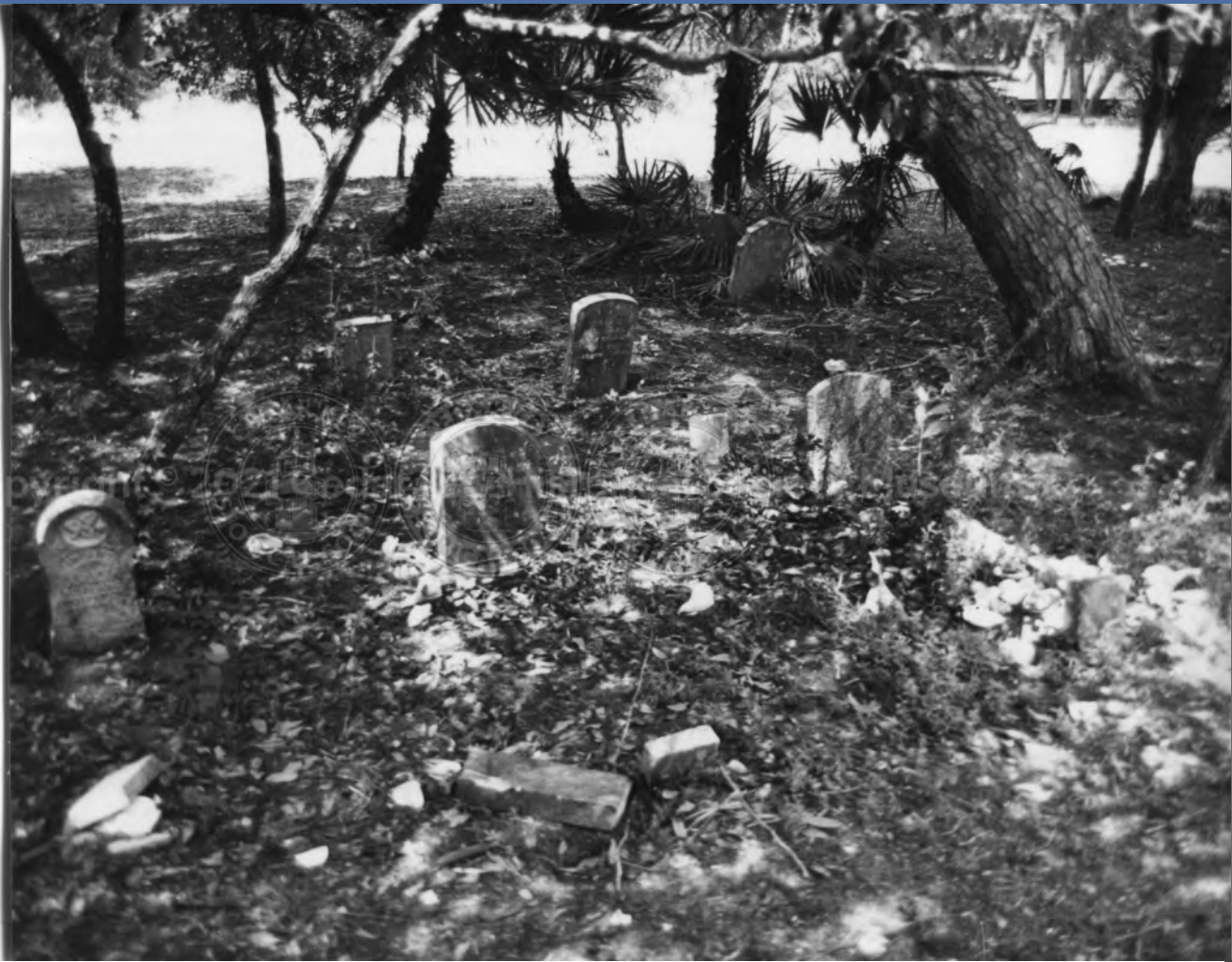
IMG06019 Bishop-Rowland cemetery 1900-1906