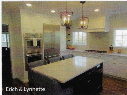
Erich & Lynnette