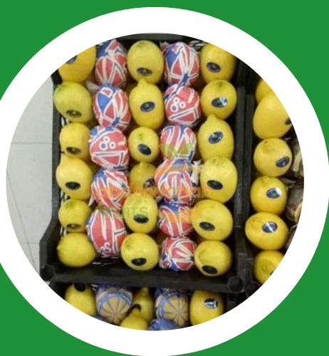
Eureka A lemon

Package: Box Packaging Availability: From April to June Varieties: Galia, Ideal, Vicar Weight: 7 kg