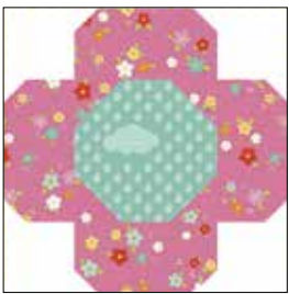
Aqua Unit E

Sew a Unit C to the top and bottom of a Unit D to create Unit E. Press. Repeat to make 2 Aqua Unit Es and 2 Yellow Unit Es.