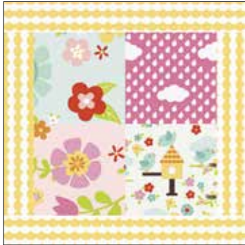
Yellow Four-Patch Block

Sew a yellow scallop 1\frac{1}{2} " x 6\frac{1}{2} " rectangle to the left and right sides of Four-Patch A. Press. Sew a yellow scallop 1\frac{1}{2} " x 8\frac{1}{2} " rectangle to the top and bottom to create the Yellow Four Patch Block. Repeat to make 4 Yellow Four-Patch Blocks.