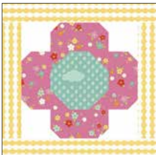
Yellow Flower Box Block

Sew an aqua scallop 1\frac{1}{2} " x 6\frac{1}{2} " rectangle to the left and right sides of Yellow Unit E. Press. Sew an aqua scallop 1\frac{1}{2} " x 8\frac{1}{2} " rectangle to the top and bottom to complete the Yellow Flower Box Block. Press. Repeat to make 2 Aqua Flower Box Blocks.