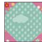
Aqua Unit B

Draw a diagonal line from corner to corner on the pink floral 1\frac{1}{2} " x 1\frac{1}{2} " squares. Place a pink floral 1\frac{1}{2} " x 1\frac{1}{2} " square on a corner of an aqua or yellow rain clouds 3\frac{1}{2} " x 3\frac{1}{2} " square. Sew on the diagonal line. Trim \frac{1}{4} " beyond seam. Press. Repeat on all the corners of the rain clouds 3\frac{1}{2} " x 3\frac{1}{2} " square to create 2 Aqua Unit Bs and 2 Yellow Unit Bs.