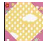
Yellow Unit B

Sew a Riley white solid 2\frac{1}{2} " x 2\frac{1}{2} " square to each side of Unit A to create Unit C. Repeat to create 8 Unit Cs.