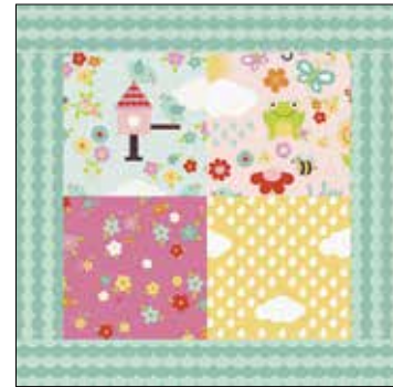
Aqua Four-Patch Block

Aqua Four Patch Block. Repeat to make 4 Aqua Four-Patch Blocks.