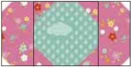
Aqua Unit D

Sew a Unit A to the left and right sides of the Unit Bs to create Unit D. Press. Repeat to make 2 Aqua Unit Ds and 2 Yellow Unit Ds.