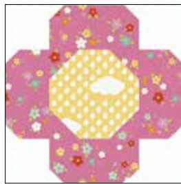
Yellow Unit E

Sew a yellow scallop 1\frac{1}{2} " x 6\frac{1}{2} " rectangle to the left and right sides of Aqua Unit E. Press. Sew a 1\frac{1}{2} " x 8\frac{1}{2} " yellow scallop rectangle to the top and bottom to complete the Aqua Flower Box Block. Press. Repeat to make 2 Yellow Flower Box Blocks.