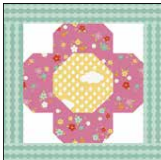
Aqua Flower Box Block