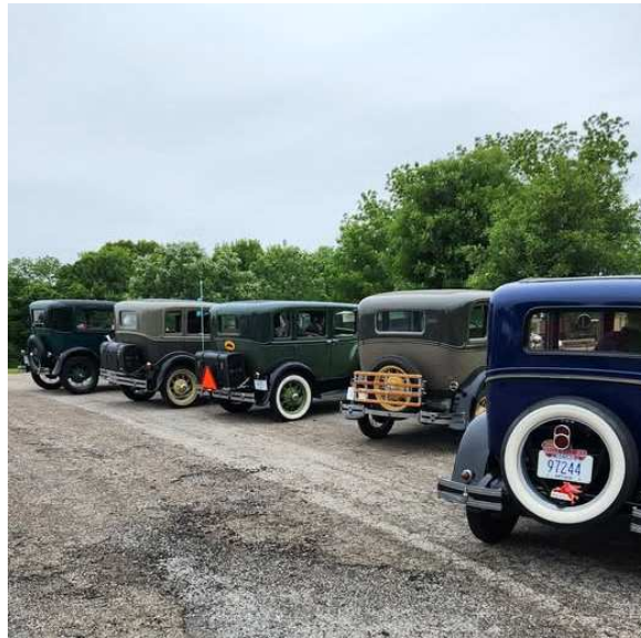
Five cars braved the rainy forecast and joined about 30+-POA members to attend the Memorial Day Picnic at WYCO Park. Thank you to whoever shared the picture on Facebook.

I am looking for ideas for a August tour if anyone has a suggestion. Being it will be HOT, I hope we can find somewhere to go that will be inside.