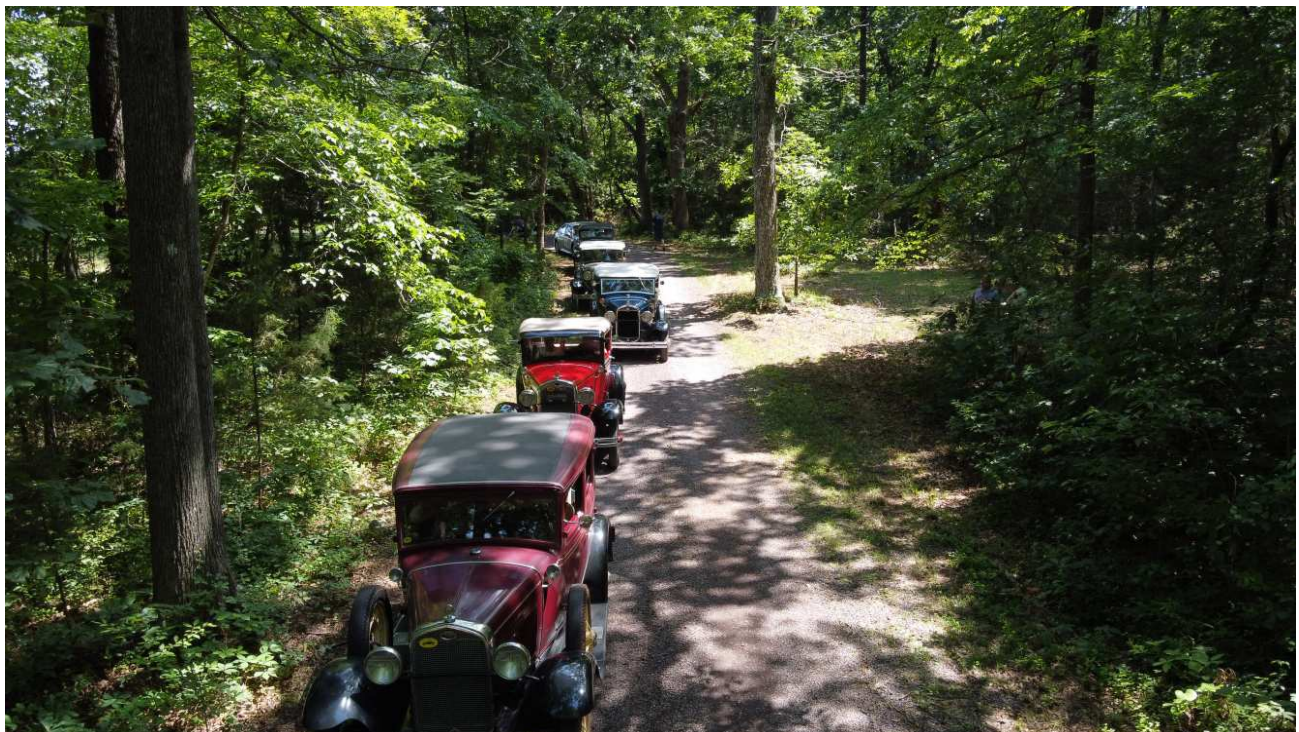
Model As Traveling down a wooded country road during the 2025 MAFCA National Tour - President Ed Tolman, photographer.

Everyone has stories. You'll figure out what makes your adventure valuable to you, and others, by telling stories. Tell them and tell them again. When they are all polished-up, submit your stories to the newsletter. They don't have to be about the national tour. Some stories will rival those of other intrepid adventurers. Some won't. Either way, we will learn about how to face a world full of challenges and what it's like to be you. Storytelling is the point of going on adventures. Go on one soon!