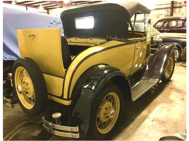
1930 Model A