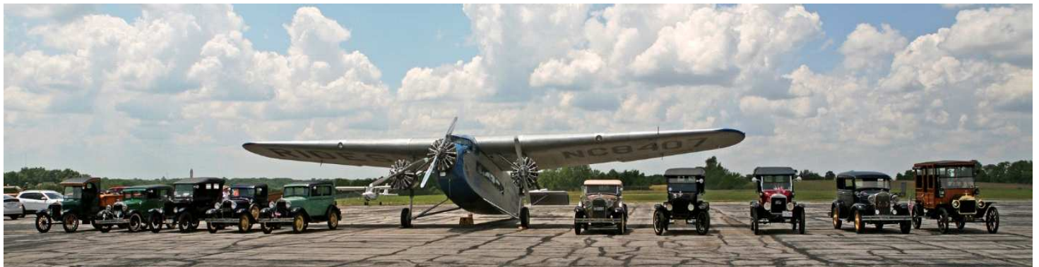
Ford Tri-Motor Event