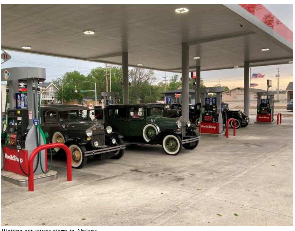
Waiting out severe storm in Abilene.