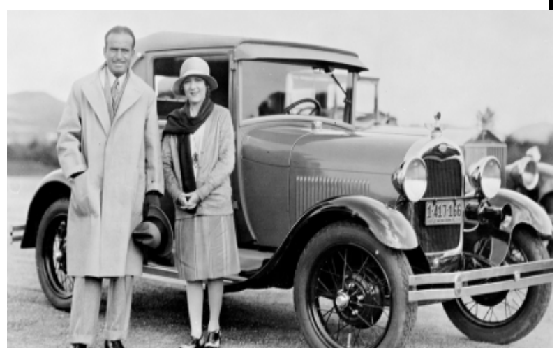
Douglas Fairbanks and Mary Pickford with 1928 Ford Model A

The new Ford was a completely different car that did not carry-over any parts from the Model T. It was lower and sleeker than the Model T and had beautiful bodylines that were the direct influence of Edsel Ford's styling ideas. While it still used a four cylinder, similar to the Model T, the Model A was more powerful and smooth and was capable of 55 to 65 mph. It came with Triplex shatterproof safety windshield and hydraulic shocks, both a first for Ford and unheard of in the low-priced field. It was also the first Ford to carry the famous blue oval logo and the first car assembled at the new Rouge manufacturing complex. As for the name, Henry Ford said that the car was so new and different that they would "wipe the slate clean and start all over again with Model A."