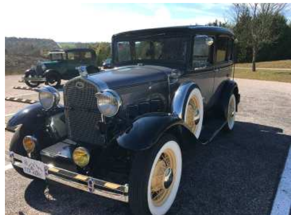
Cover photo for the Facebook Page.