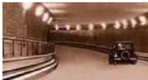
Photo of the first car to use the tunnel in 1930. Some said it was a Model A!