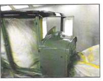
Application of color to vehicle soon to be owned by a lucky family.

Please address your tax-deductible donation to: PHSMAFC, 1968 Lake Ave, Suite 101, Altadena Ca. 91001. Kindly include a stamped, self-addressed envelope along with your phone number and email address. Your entry will be return mailed to you. Clear printing is appreciated. We also accept credit and debit cards by calling 626-375-1367. Winners need not be present. We also welcome any tax-deductible Model A vehicle donation in reasonable restorable condition. Contact us at <u>phsmafc@gmail.com</u> to request an email version of this document.