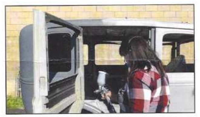
Priming before applying final paint color.

We receive no funding from the local school district, nor assistance from MAFCA. We rely solely on our annual raffle. For each one hundred dollars ($100.00) contributed, the donor receives one raffle entry. Odds of winning are fabulous, given we limit the number of entries sold. Additional cash prizes will also be awarded. We encourage those who can purchase multiple tickets do so, and for that we express our sincere gratitude.