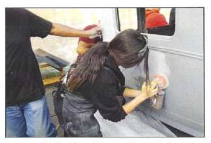
Students learn the use of power tools.