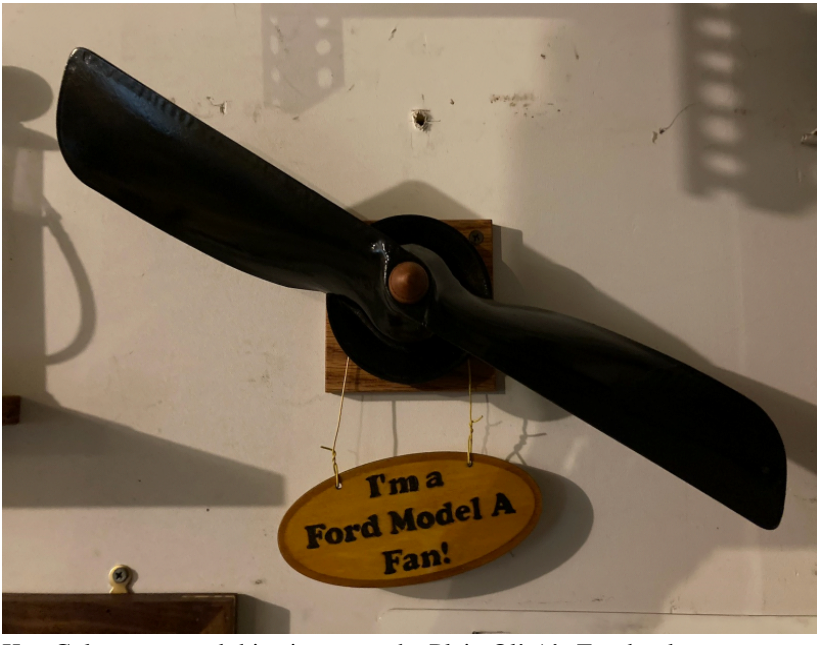
Ken Coleman posted this picture on the Plain Ol' A's Facebook page.