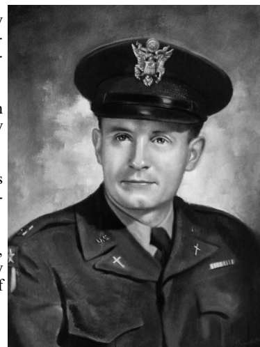
Army Chaplain Fr. Emil Kapaun

Father Kapaun became an Army Chaplain during World War II. However, it was during the Korean War that Chaplain Kapaun's heroics truly came to light. During the fierce fighting at the beginning of the war, Father Kapaun braved bullets and artillery fire to minister to the men of the 1st Cavalry Division. Refusing safety, Kapaun went from foxhole to foxhole to administer the sacraments, provide encouragement, and to pray with his 'boys'.