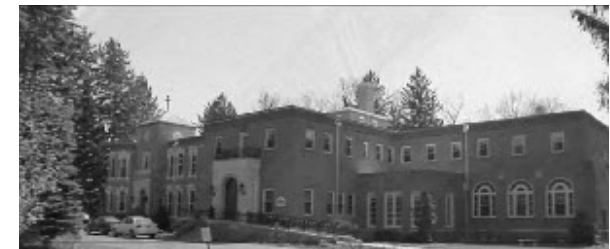
Our Lady of the Pines Retreat Center

Servants in Song Worship Team will be leading us in Praise and Worship