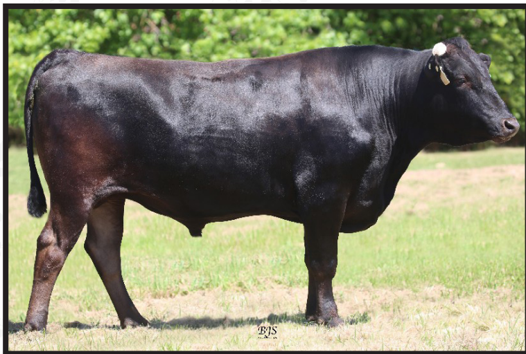
Sire: ARUBIAL UNITED P0342 (AI) (ET)