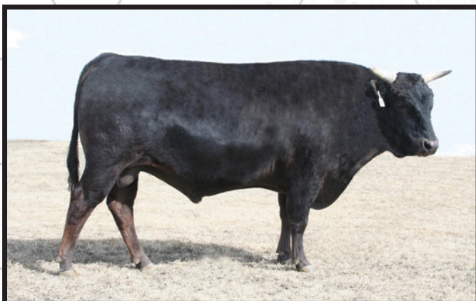
CHR Kitaguni 07K