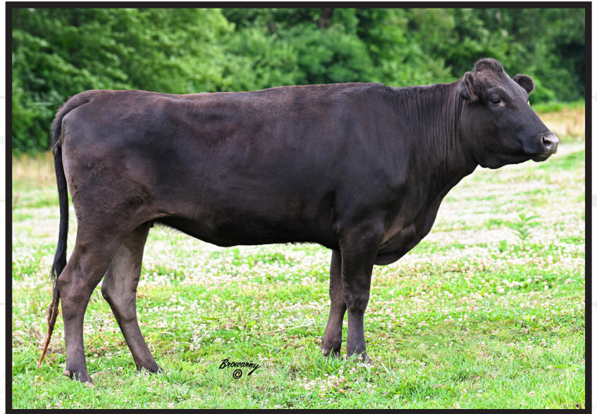
Dam: SYNERGY F126 HIKOKURA R563 (ET)

59.44% IMF, 105.63 cm 2 REA, & 920 lbs HCW!