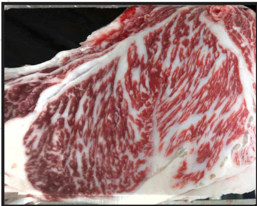
United Steer from Arubial Wagyu: dMS 13.30 & 519.5 kg HCW