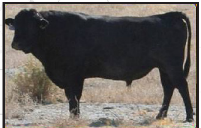
CHR Takazakura 101L