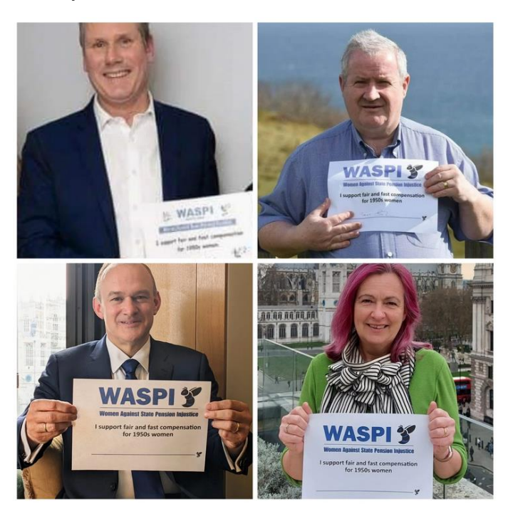
Opposition leaders have pledged their support for fair and fast compensation

When the PHSO's final recommendations on compensation are published we will need as much support as possible at Westminster. In March 2022 we began an initiative to persuade MPs to sign a simple pledge saying "I support fair and fast compensation for 1950s women". All four of the main party leaders (Labour, Liberal Democrat, Scottish National Party and Plaid Cymru) had signed by May 2022 and since then the numbers have been growing steadily.