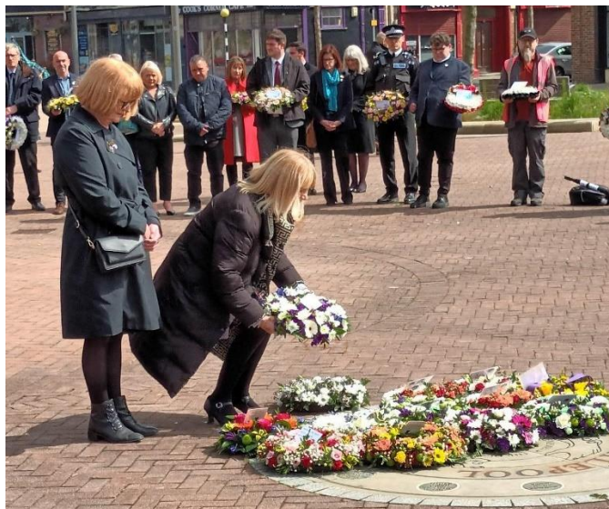
Hartlepool WASPI laying a wreath on International Workers Memorial Day in April 2023

Groups have also taken part in a number of local events to raise and maintain awareness of our campaign. The Durham WASPI group joined the Durham Miners Gala; the Glasgow, Lanarkshire, East Dunbartonshire and Renfrewshire group took part in Sma' Shot Day in Paisley; the Castleford/Yorkshire group took part in the Banners Held High event in Wakefield; and in April 2023 a number of groups including Hartlepool, Aberdeen & Shires, West Lothian, Stroud & District, Burton, Salford & Eccles and West Dunbartonshire took part in events to mark International Workers Memorial Day.