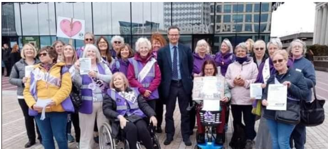
WASPI lobbyists at the Conservative Party Conference in Birmingham in October 2022 with Peter Aldous MP, Co-Chair of the State Pension Inequality for Women All Party Parliamentary Group

It's now over two years since the Parliamentary and Health Service Ombudsman (PHSO) published the findings of stage 1 of his investigation into the communication of changes to women's State Pension age. His report found that there had been maladministration by the DWP in communicating the changes to women's State Pension age, albeit during a limited time period.