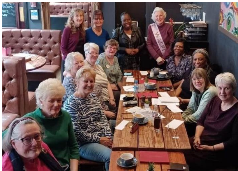
Birmingham WASPI group meeting with their MP Paulette Hamilton

Our groups are vital in keeping the campaign alive at a local level and now that COVID restrictions are a thing of the past, members have been able to meet in person once more. Groups have continued to meet with their MPs wherever possible, and a number have organised motions of support from their local councils.