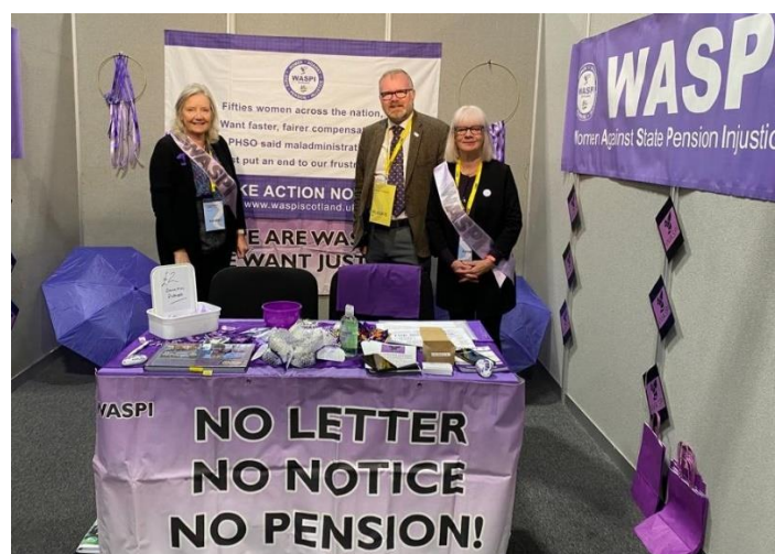
WASPI stall at the SNP Conference in Aberdeen in October 2022 with Martyn Day MP

In October 2022 we lobbied the Labour Party Conference in Liverpool and the Conservative Party Conference in Birmingham, and had a stall at the SNP Conference in Aberdeen. In January 2023 I represented the campaign at a private meeting of supportive Labour MPs at Westminster, and a similar discussion is planned with supportive Conservative MPs in September. However, no party has so far made an unequivocal commitment to the implementation of the PHSO recommendations or included such commitments in their party manifestos.