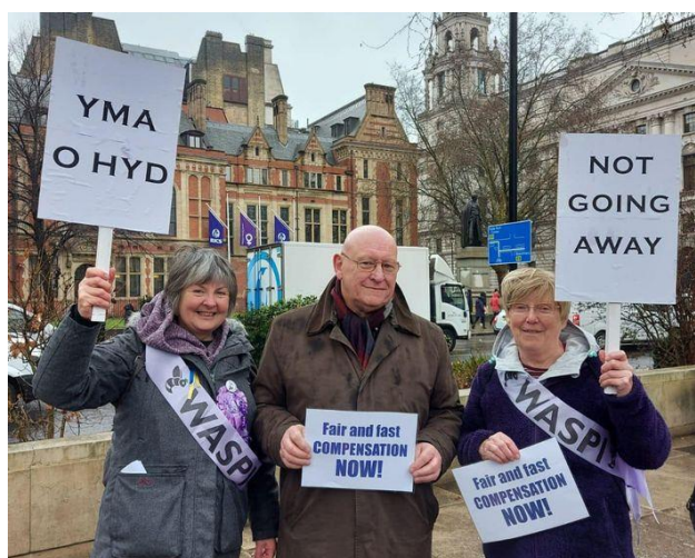
Ceredigion WASPIs with Hywell Williams MP at the International Women's Day rally in March 2023

In March 2023 our groups were well represented at the International Women's Day rally in Parliament Square organised by 1950s Women United, and at other International Women's Day events. The West Dunbartonshire Group worked with the local council to organise a flag raising ceremony and the Salford and Eccles Group had a stall in a local supermarket promoting the group and the campaign. Many groups also arranged for local landmarks to be lit up in purple. Template news releases, leaflets and placards were made available to groups participating in the rally and in local events, and merchandise was available to purchase.