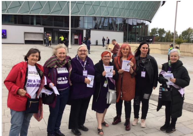
WASPI lobbyists at the Labour Party Conference in Liverpool in September 2022

When the recommendations are eventually published (and assuming they are acceptable) we will need as much support as possible at Westminster to ensure that they are implemented swiftly and fairly. During 2022-23 we have continued to urge MPs to sign a simple pledge saying "I support fair and fast compensation for 1950s women". A gallery of these can be found on our website at https://waspicampaign2018.co.uk/westminster-supporters .