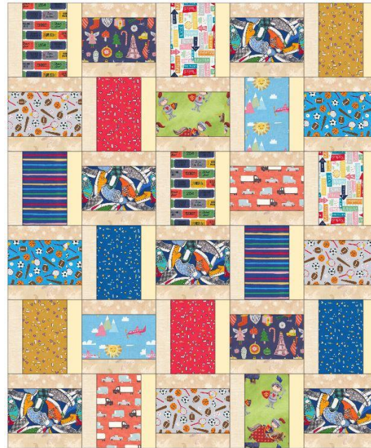
Child small, 37.5 x 45", 5 x 6 block layout, 30 blocks

This design can be as scrappy as possible or can be made with as few as 2 feature prints plus a solid. If using two feature prints, for the large size, 3/4 yard of each and 1-1/4 yards of contrasting fabric are needed. Make 24 blocks of each print.