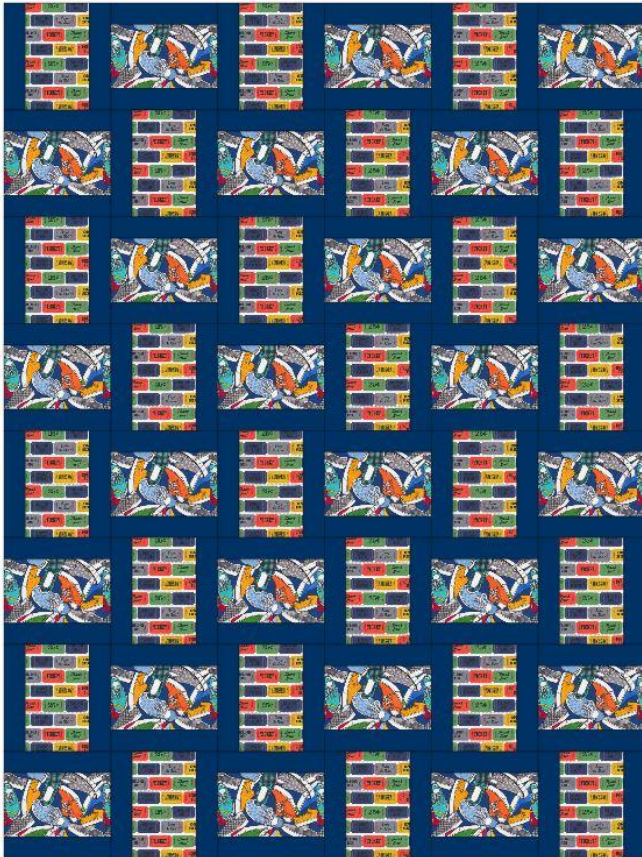
Child large, 45 x 60", 6 x 8 block layout, 48 blocks