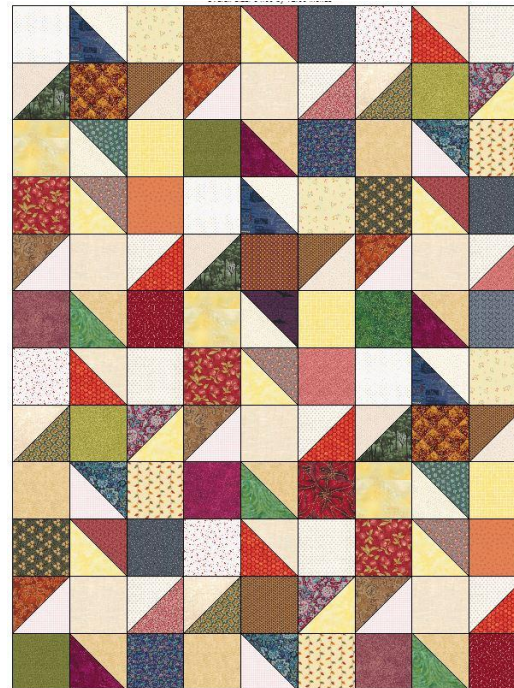
Throw, 54" x 72" 3 x 4 block layout, 12 blocks