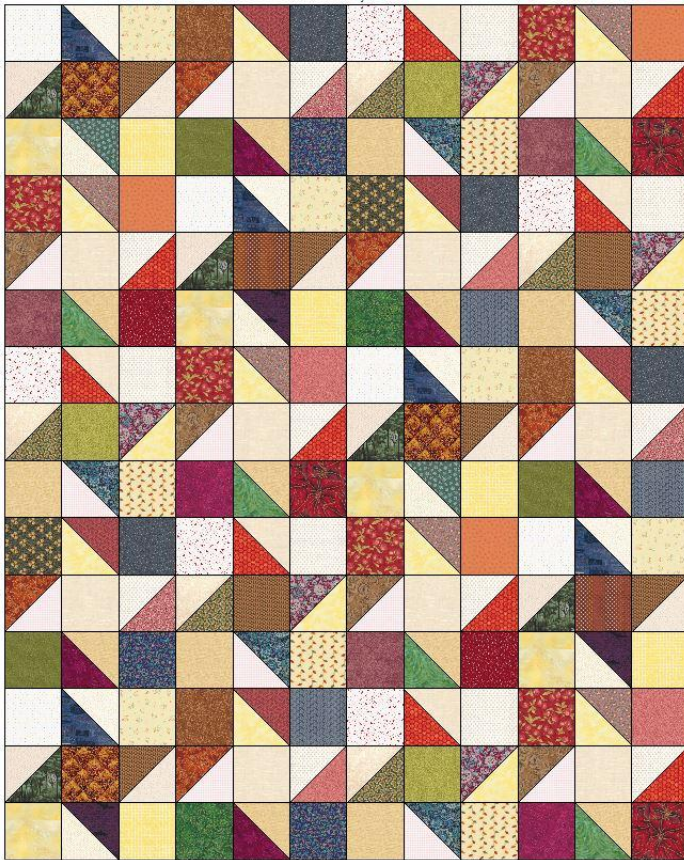
Twin, 72" x 90" 4 x 5 block layout, 20 blocks