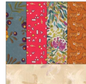
Block, 8" finished (8-1/2" unfinished)