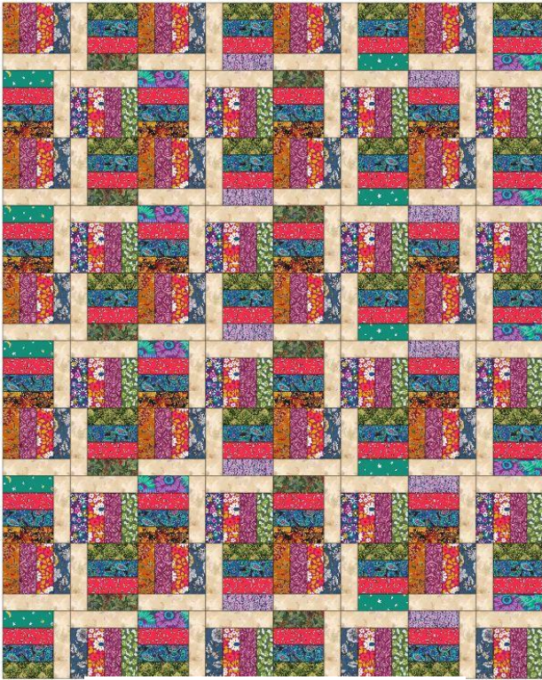
Large throw, 64" x 80", 8 x 10 block layout, 80 blocks