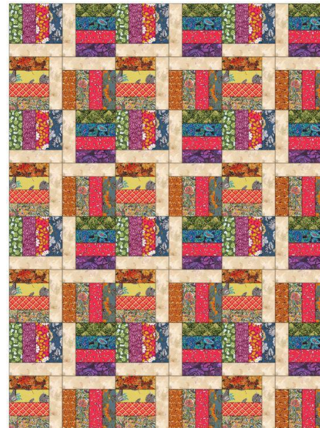
Small throw, 48" x 64", 6 x 8 block layout, 48 blocks