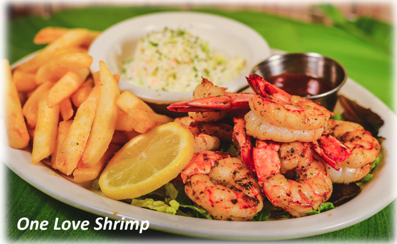
One Love Shrimp