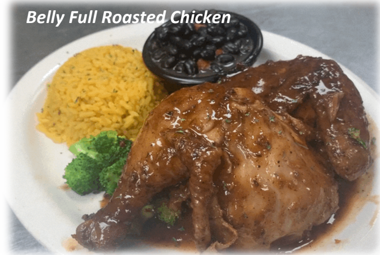
Belly Full Roasted Chicken