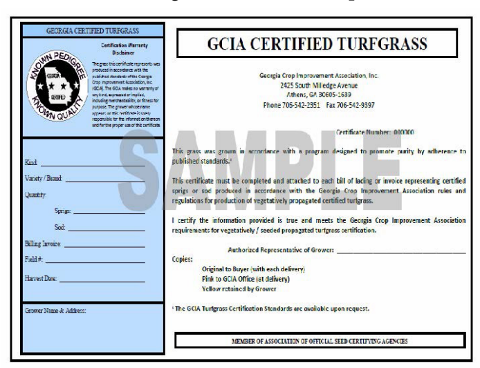
Figure 1. Sample Georgia Crop Improvement Association (GCIA) certified turfgrass certificate.

Over the years, Tifway has become contaminated or mislabeled. In the mid-1990s, a group of scientists, sod producers, and the Georgia Crop Improvement Association (<a href="www.GeorgiaCrop.com">www.GeorgiaCrop.com</a>) initiated the Georgia Turfgrass Certification Program to maintain the cultivar integrity of all participating grasses, but specifically Tifway. By using only Georgia Crop Improvement "blue tag" certified Tifway bermudagrass, the end user is assured of getting varietal purity and uniformity (Figure 1).