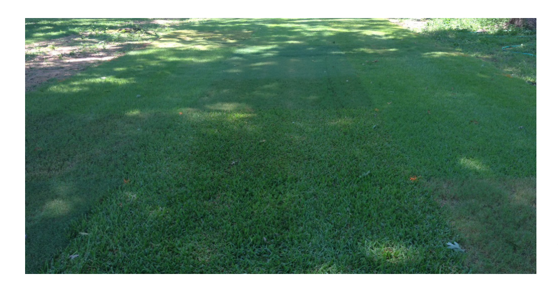
Figure 2. A study evaluating warm-season grass cultivars (two St. Augustinegrasses, four bermudagrasses, and 11 zoysiagrasses) under a hardwood shade.

Establishment is predominately by vegetative methods (e.g., sod, sprigs, or plugs) but there are two commercially available seeded cultivars: 'Zenith' and 'Compadre'. Both cultivars can also be planted from sod. Relative to other grasses, zoysiagrass has a lower nitrogen requirement, only needing 1.0 to 2.0 pounds of nitrogen per 1000 ft<sup>2</sup> per year.