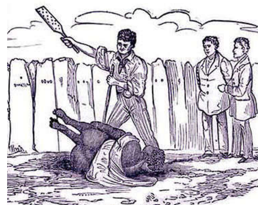
Common mode of whipping with the paddle.

In 1981, a 17-year-old student claimed bleeding wounds as a result of a school paddling. [18] It was alleged that the assistant principal who had administered the punishment had held and swung the paddle with two hands. [19] In order to prevent such claims, a school district currently may choose to require the handle of a spanking paddle to be "just large enough for a normal one-hand grip". [20] Or a rule might provide that the handle shall not be more than 4 inches (100 mm) long (just large enough to be held with one hand). [21]