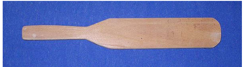
A spanking paddle

A spanking paddle is an implement used to strike a person on the buttocks. The act of spanking a person with a paddle is known as "paddling". A paddling may be for punishment (normally of a student at school in the United States), or as an initiation or hazing ritual.