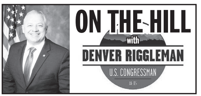
March 13, 2020

Thankfully, the House agreed to the Senate's position that, rather than borrowing money for needed construction, we are planning to spend cash on some of those projects. As well, we set aside $2 billion in case things