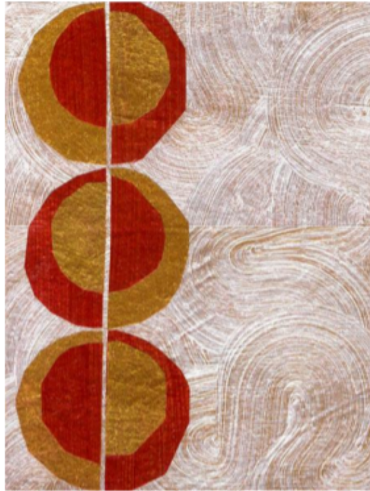
You in Me in You

59 Court Street, Hamilton, Bermuda HM 12 Ph: 441-292-0505 – Email: stpaulamebda@gmail.com Website: www.stpaulamechurchbermuda.org