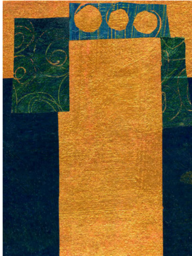
The Sheeppate

59 Court Street, Hamilton, Bermuda HM 12 Ph: 441-292-0505 – Email:stpaulamebda@gmail.com Website: www.stpaulamechurchbermuda.org