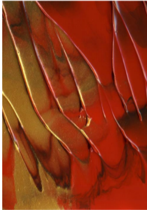
Pentecost Fire

59 Court Street, Hamilton, Bermuda HM 12 Ph: 441-292-0505 – Email: stpaulamebda@gmail.com Website: www.stpaulamechurchbermuda.org