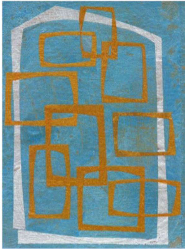
Many Rooms

59 Court Street, Hamilton, Bermuda HM 12 Ph: 441-292-0505 – Email: stpaulamebda@gmail.com Website: www.stpaulamechurchbermuda.org