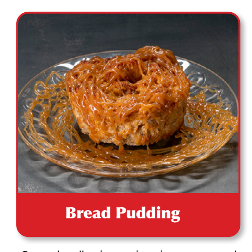
Carmel roll pieces in cinnamon and nutmeg spiced custard, served with our Classic Caramel Sauce.