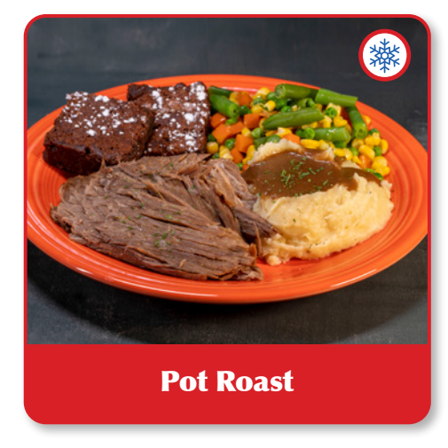
Pot roast with mashed potatoes and beef gravy, vegetables and dessert.