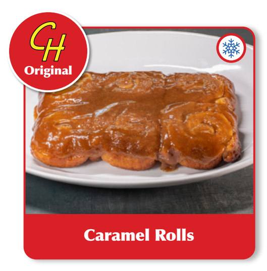
Available in Frozen 2 Packs and 6 Packs.