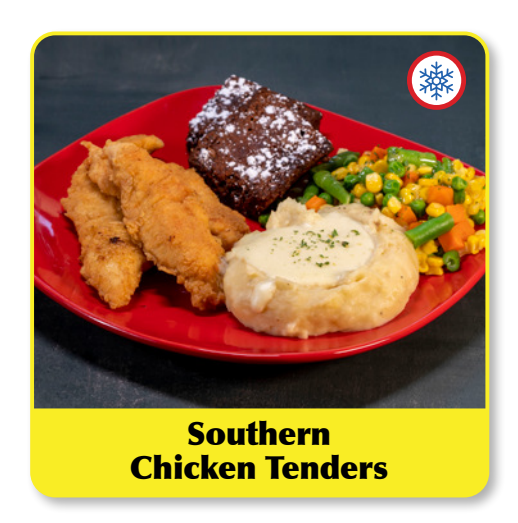
Fried 5oz. tenders with mashed potatoes and beef gravy, vegetables and dessert.