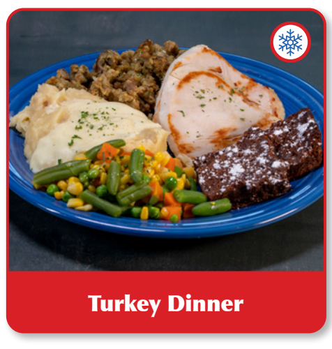
Healthy portion with mashed potatoes and turkey gravy, dressing, vegetables and dessert.