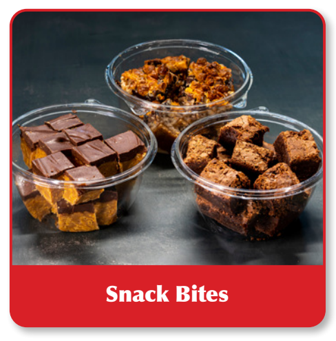
Your Choice of: Peanut Butter Crunch, 7 Layer, and Fudge Brownie.

A cracker base layered with a sweetened cream cheese, smooth pumpkin filling plus a delicate white chocolate layer. Crowned with creamy whipped topping.