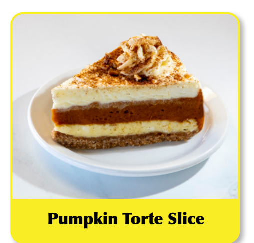
A cracker base layered with a sweetened cream cheese, smooth pumpkin filling plus a delicate white chocolate layer. Crowned with creamy whipped topping.