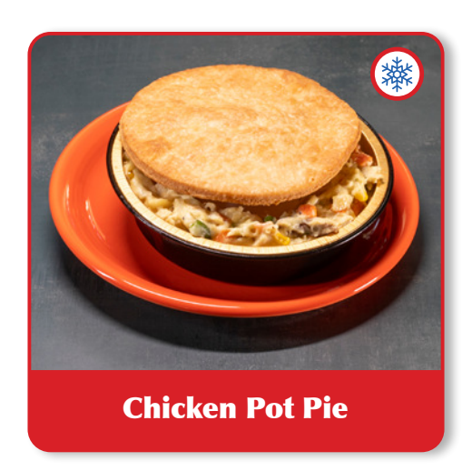
Available in Two Sizes: Large Family Size and Small Single Size.