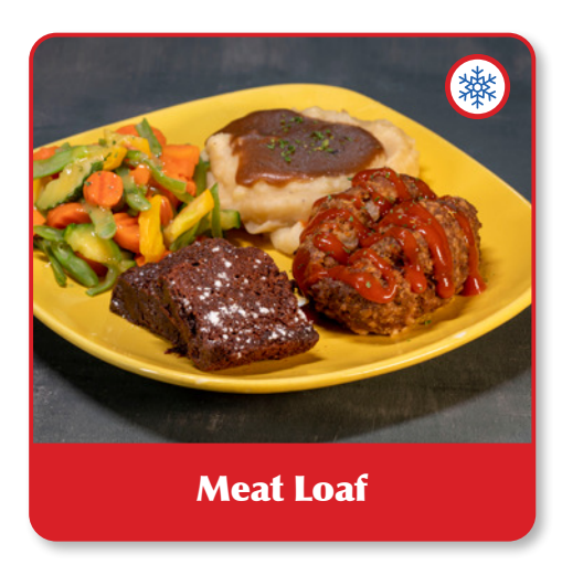
Meat loaf with mashed potatoes and gravy, vegetables and dessert.