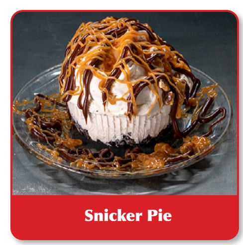
Oreo crumb crust mixed with a blend of vanilla ice cream and Snicker Bar pieces, drizzled with chocolate and our Caramel Vanilla Sauce.