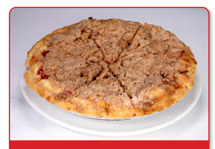
Sour Cream Rhubarb Pie

A rich and indulgent pie with a sweet filling of pecans, bourbon, and a hint of vanilla. Baked in a golden, flaky crust for a decadent treat.