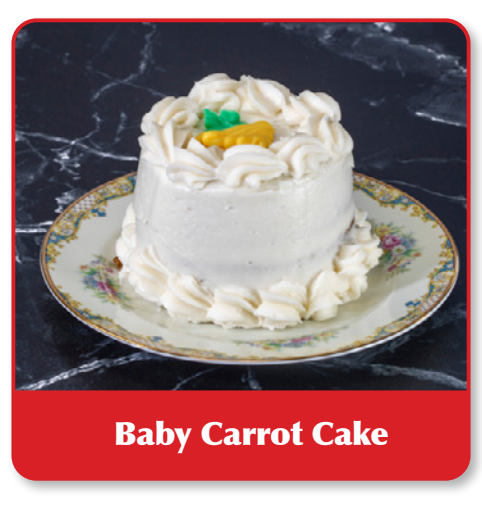
Another fan favorite, filled with sweetness and spice.