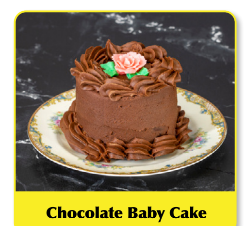
A chocolate lover's dream. Take one for yourself or share it with others if you're feeling generous.