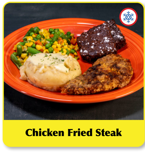
4oz. steak with mashed potatoes and chicken gravy, vegetables and dessert.