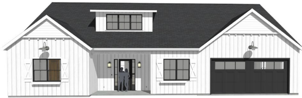
MODERN FARMHOUSE ELEVATION