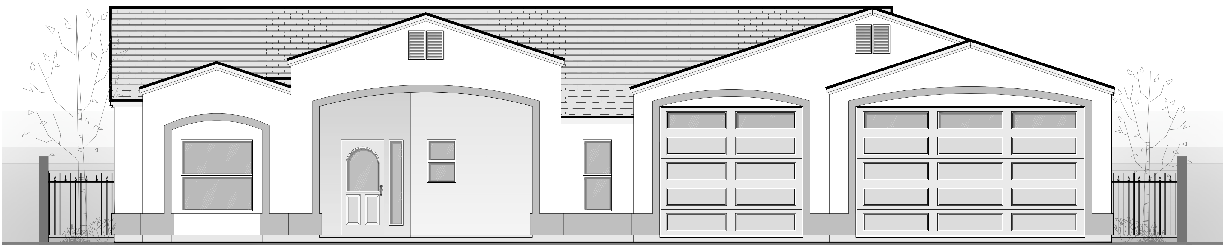
FRONT ELEVATION SCALE: NTS