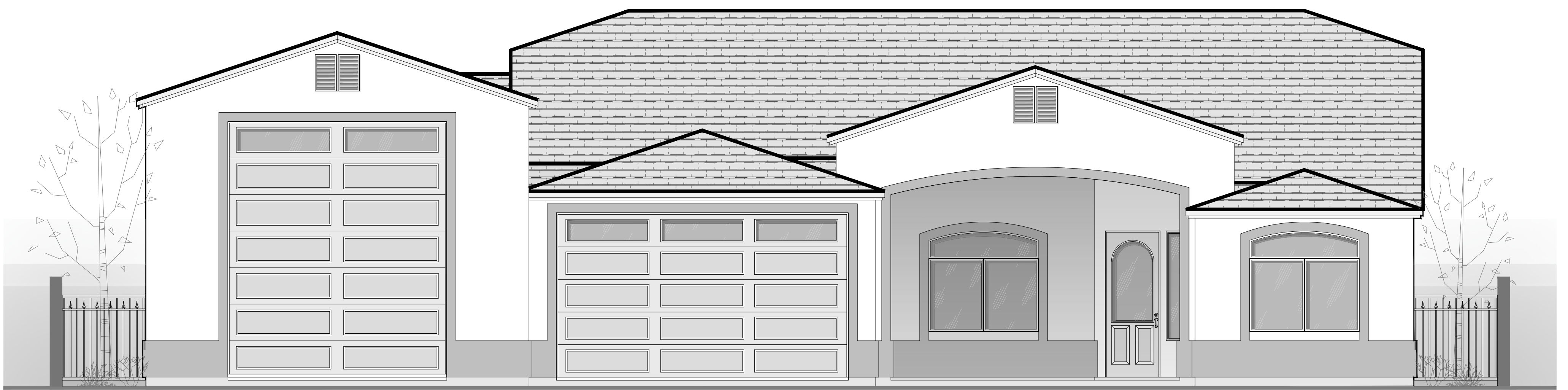
FRONT ELEVATION SCALE: NTS